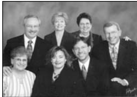
OUR PASTORAL STAFF TEAM