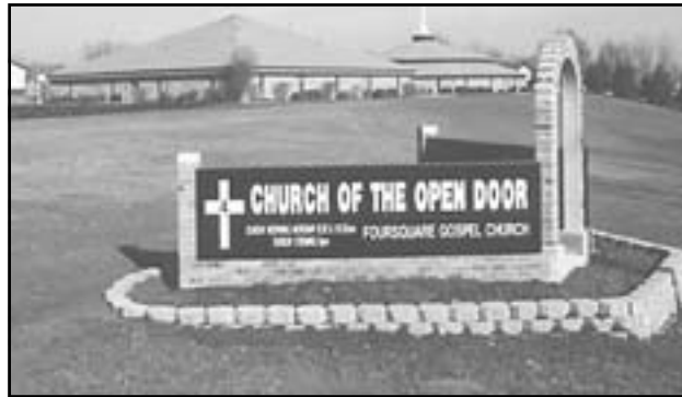
CHURCH OF THE OPEN DOOR CAMPUS

U-Turn Youth Ministries (Jr. & Sr. High)